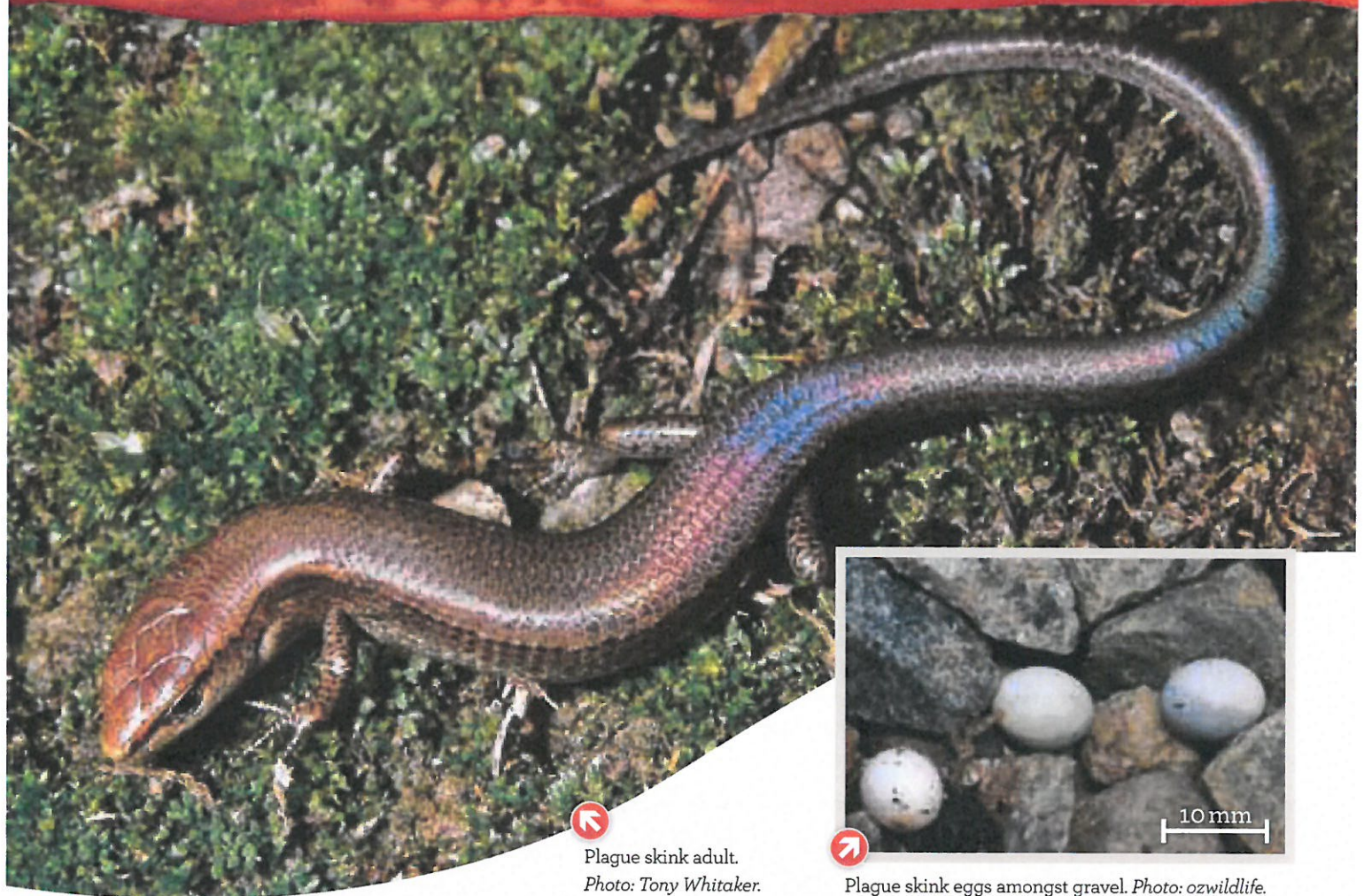
Plague skink adult.