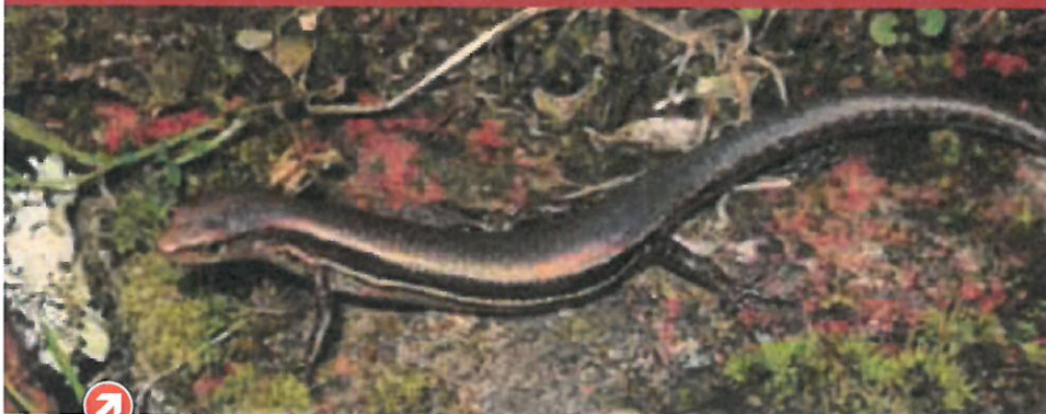
Plague skink adult.

As plague skinks are not presently known from the South Island or most of New Zealand's offshore islands, it is important that you immediately report any sightings in these areas to MAF Biosecurity New Zealand (on 0800 80 99 66) or the Department of Conservation hotline (0800 362 468) .