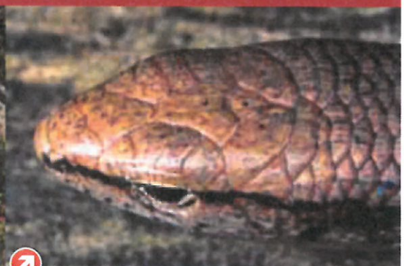
Plague skink head.