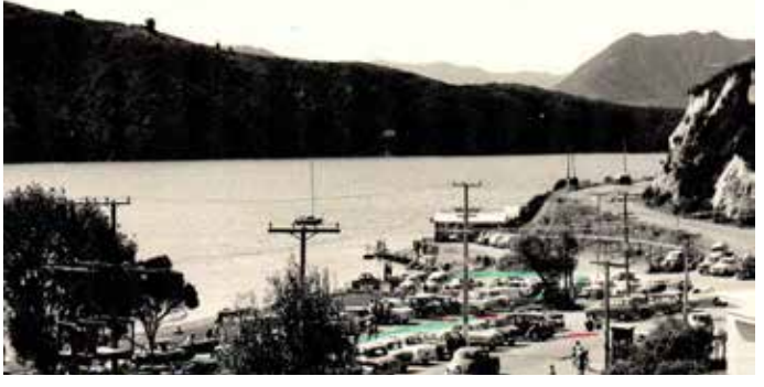
Waikawa Foreshore circa 1967

The Reserves Act 1977 requires reserve management plans to be prepared for reserves under the control of the Council. While parts of the Waikawa Foreshore were first gazetted back in the late 1970s, no reserve management plan was prepared at the time. The development of this plan (under the Reserves Act) is therefore the first one for this popular coastal reserve.